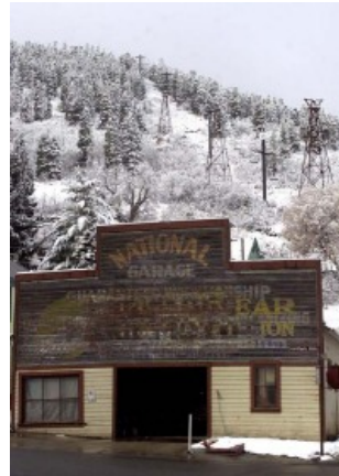
High West Distillery and Saloon