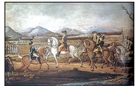
George Washington reviews the troops near Fort Cumberland, Maryland, before their march to suppress the Whiskey Rebellion in western Pennsylvania.

out in Melville's Moby Dick ("unspeakable old Monongahela") in 1851. OMG's dynasty grew even more after the Civil War destroyed nearly all transportation from Kentucky south. But Prohibition changed all this. The distilleries in Pennsylvania all went out of business and the industry there never recovered to the extent the bourbon distilleries in Kentucky did. Rye whiskey had faded away...Until now!