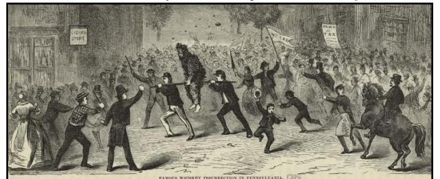
"Famous Whiskey Insurrection in Pennsylvania", an 1880 illustration of a tarred and feathered tax collector being made to ride the rail.